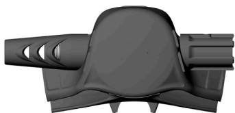
200-120 Balanced Scuba Regulator