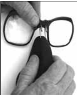
Put "legs" into the receiving holes of the oral nasal, P/N 510-747 and push all the way on.

Note: Make sure that the "legs" are oriented facing downward.