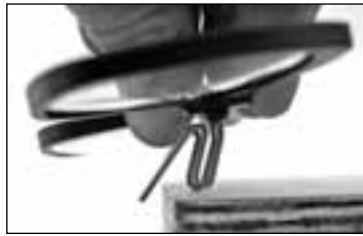
Push against a firm surface until you feel a "click"

2. Once the Lenses have been installed, attach the Mount Wire, P/N 530-923 onto the Retainer Frame, P/N 520-538 by inserting it into the slot on the front of the Frames.