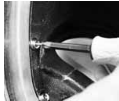
Fig: 1 A